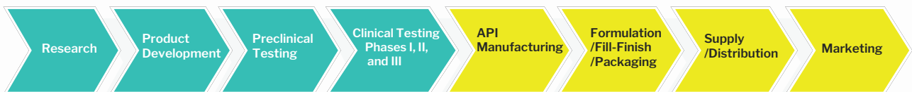
FIGURE 3: THE R&D AND MANUFACTURING LIFE CYCLE

Given the complexity and significant cost requirement of a vaccine product development and manufacturing programme, a continent-wide vaccine R&D and manufacturing process is a preferred strategy rather than a narrow nationally-focused approach. By adopting a continental-focused approach, African vaccine researchers and manufacturers can pool their resources and coordinate their efforts to build confidence with respect to Africa-based R&D and manufacturing. Moreover, the continent can further build on and leverage its partnerships in the context of South-South cooperation, and with the Global North, for rapid knowledge and skills acquisition and sharing, to quickly advance Africa-based vaccine R&D and manufacturing programs.